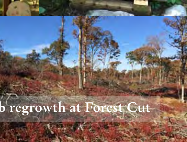
Measuring shrub regrowth at Forest Cut