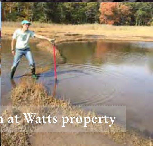
Saltmarsh restoration at Watts property