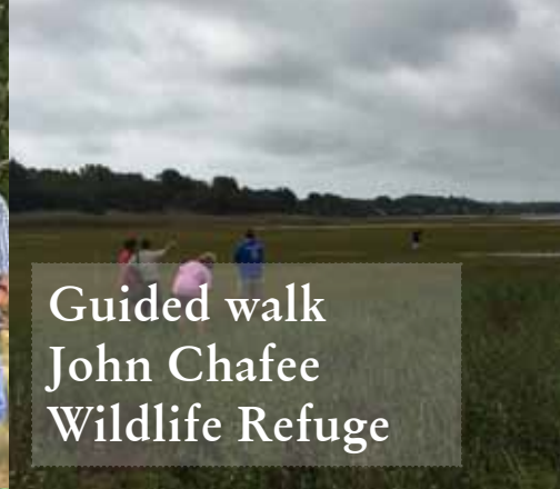
Guided walk John Chafee Wildlife Refuge