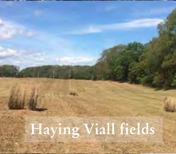
Haying Viall fields