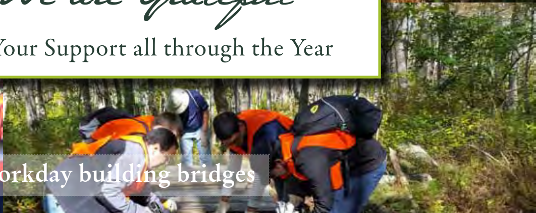
Dassault Volunteer Workday building bridges