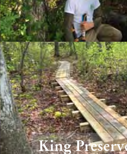
King Preserve Opening Day