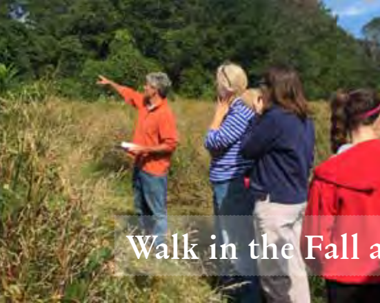
Walk in the Fall at Garrison House Acres