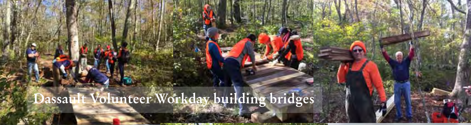
Dassault Volunteer Workday building bridges